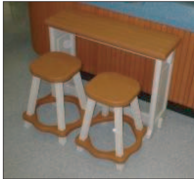
Barstools shown – optional