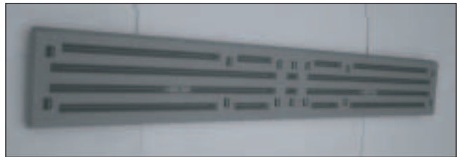
36” or 74” Plank

Note: For missing or replacement parts, please visit our website at www.conferplastics.com e-mail: patioproducts@conferplastics.com