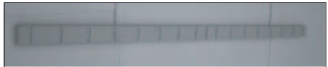
36” or 74” Bench/Bar Support – 3-1/2”