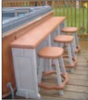
Barstools shown - optional Note: 74" bar differs from above photo.