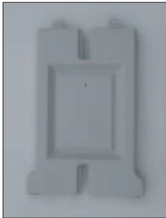
20”, 30”, or 36” Bench/Bar Leg